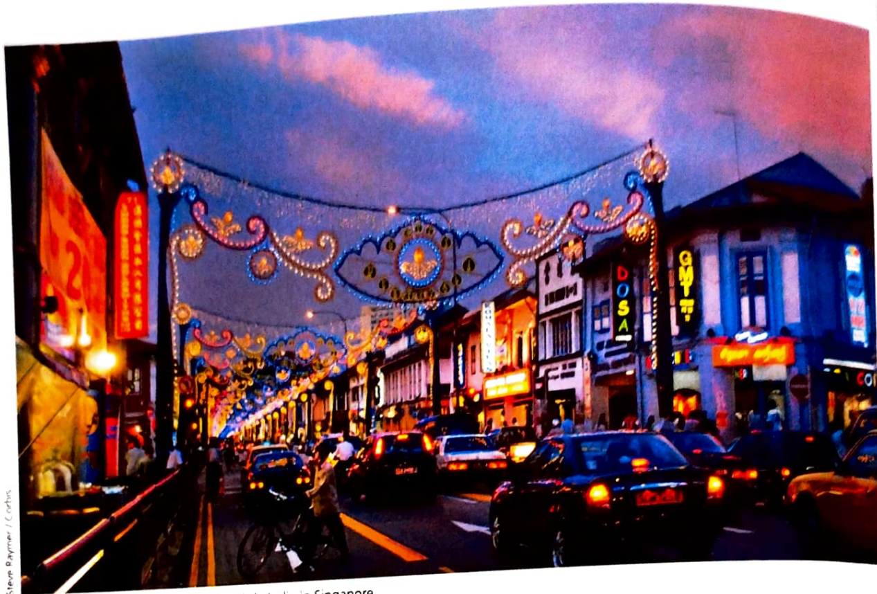
At Home Deepavali celebrations at Little India in Singapore

cutting and polishing industry. The Indian diaspora has also had important trade enhancing and investment effects.